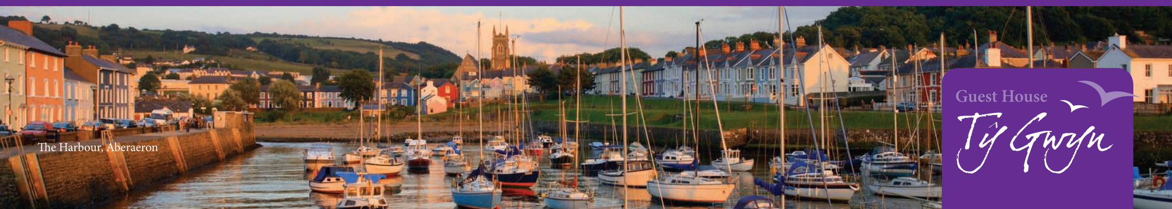
The Harbour, Aberaeron