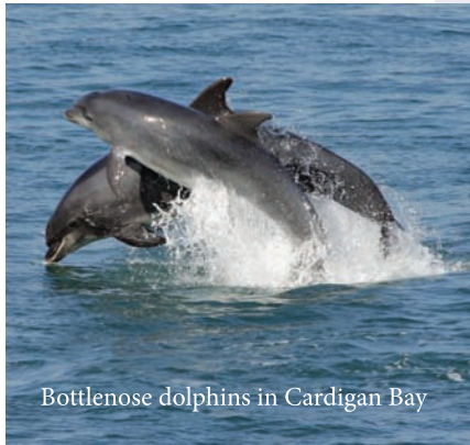
Bottlenose dolphins in Cardigan Bay